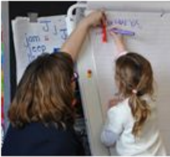
Whole Group Activities