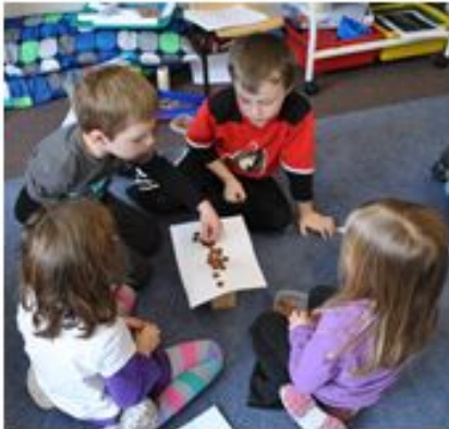
Small Group Exploration