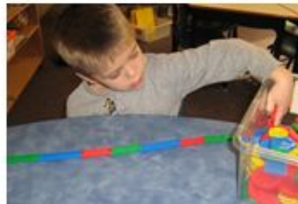
Small Group Instruction